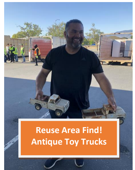
Reuse Area Find! Antique Toy Trucks