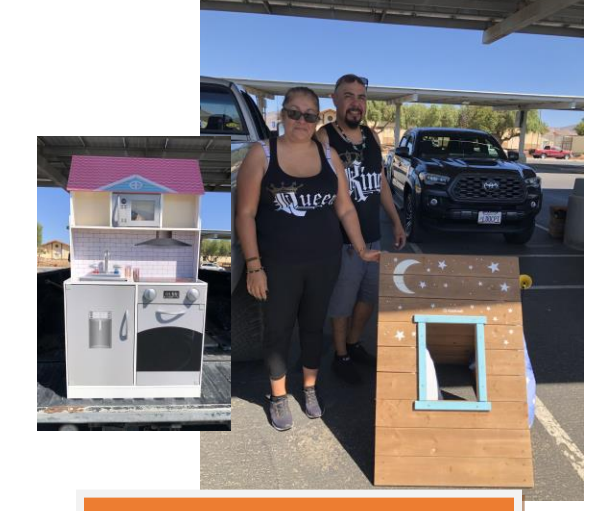
Reuse Area Finds! Children's Play Equipment